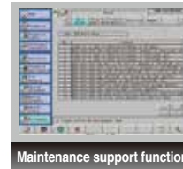
Maintenance support function