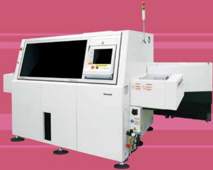
Model No. NM-EJR4A