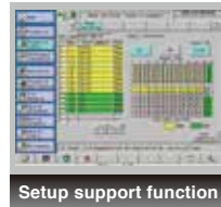
Setup support function